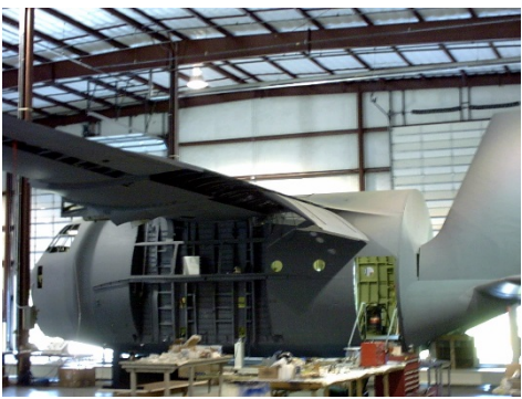
Flight Control Trainer, $14.8 million