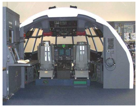
Integrated Cockpit Systems Trainer, $31.4 million

Enhance performance through education to forge the leaders of tomorrow