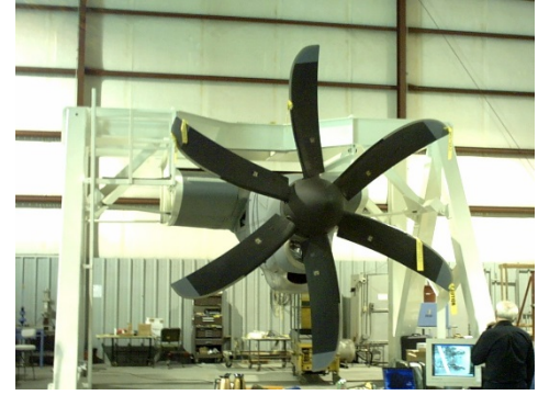
Engine Propeller Trainer, $13.8 million