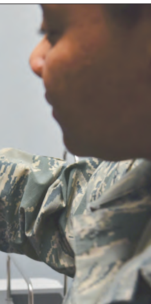
imaging technologist, examines a X-ray cassette. The cassettes