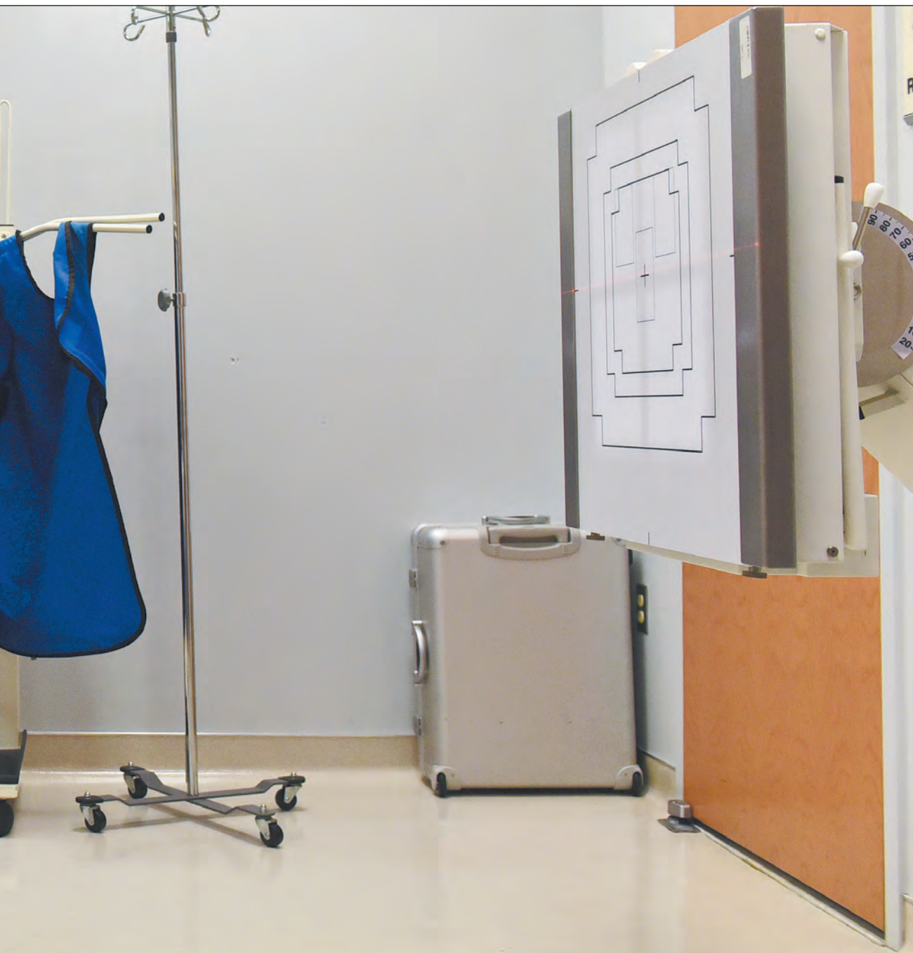
s for a standard and reference point for Hall, when she is taking X-rays.