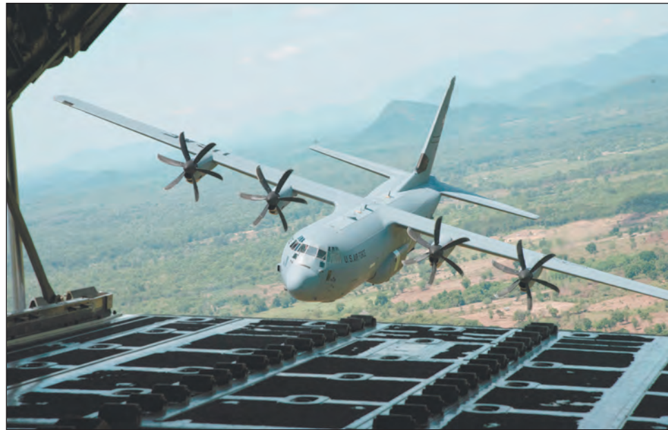
A U.S. Air Force C-130J Super Hercules flown by the 327th Airlift Squadron, Little Rock Air Force Base, flies over Sri Lanka Air Force Station Ampara, Sri Lanka, on Sept. 15, 2017 as part of Pacific Airlift Rally 2017. Crews from the 327th AS and 815th Airlift Squadron, Keesler Air Force Base, Miss., conducted an airdrop as part of a demonstration for military members from the U.S. and 12 nations in the Indo-Asia-Pacific area who participated in the biennial Pacific Air Forces-sponsored exercise in Sri Lanka, from Sept. 11 through Sept. 15.

As an FOC unit, the 327 AS is now capable of fulfilling both Air Force Reserve Command and Air Mobility