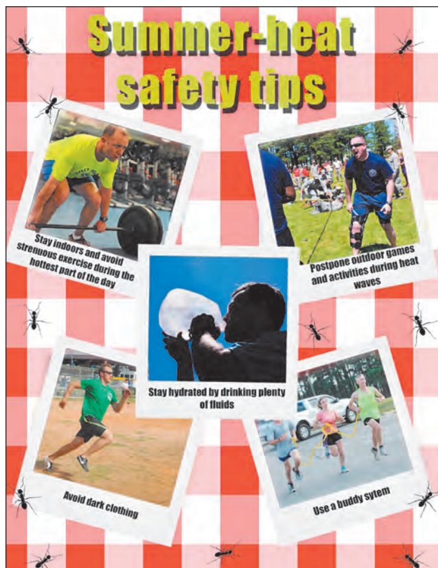
U.S. AIR FORCE GRAPHIC BY AIRMAN 1ST CLASS GRACE NICHOLS

Avoiding heat-related incidents involves more than hydration and nutrition; knowing basic guidelines is helpful and important. Regardless of the activity, staying aware of the heat and properly preparing could help prevent illness and possibly save a life.