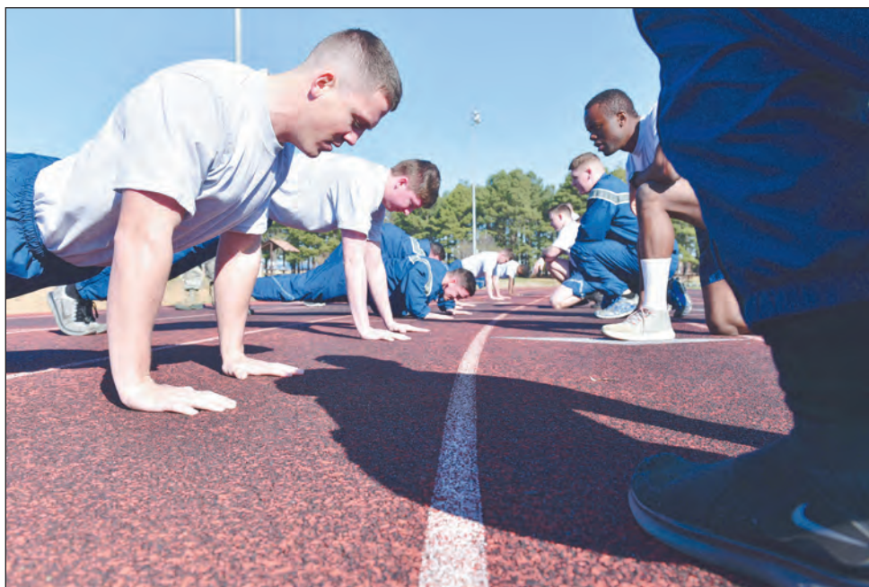
Deployment Airmen Readiness Training (DART) perform the push-up portion of a mock physical fitness test March 8 at Little Rock Air Force Base. Airmen can earn up to 10 points from the push-up portion of the physical fitness test.

The DART program covers 14 CBTs, nine in-person requirements and accomplishes a total of 40 hours of prerequisites for the Airmen. This allows them to dedicate their full time and energy towards accomplishing the mission.