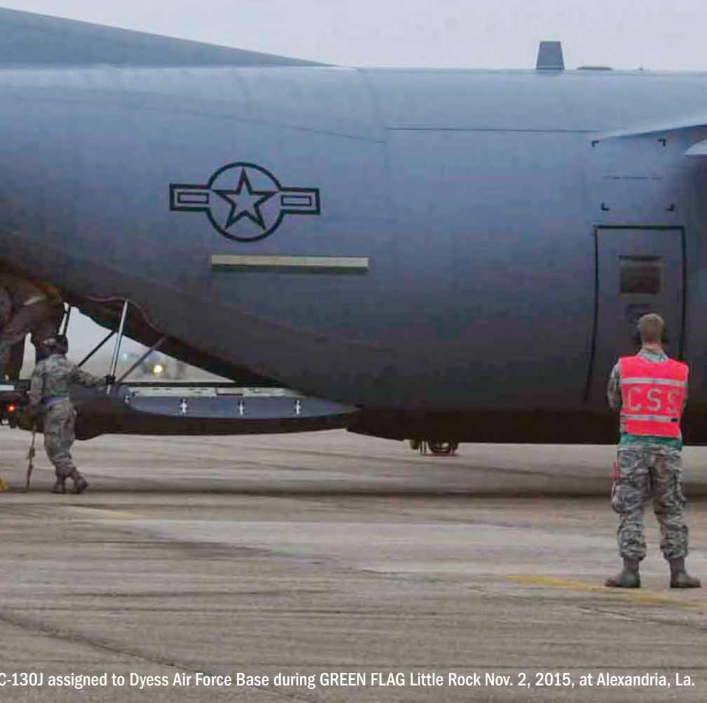
U.S. Air Force Senior Airman Myles Crane, an 821st Contingency Response Squadron aerial porter, loads a Humvee onto a C-130J assigned to Dyess Air Force Base during GREEN FLAG Little Rock Nov. 2, 2015, at Alexandria, La.