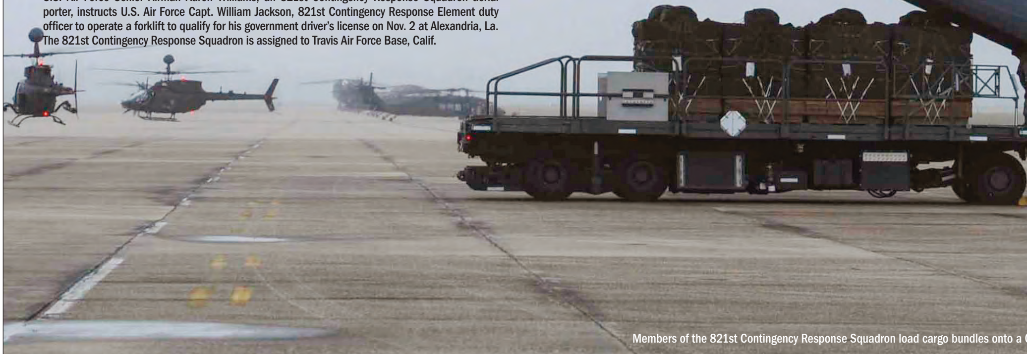
Members of the 821st Contingency Response Squadron load cargo bundles onto a C-17 at Alexandria, La.