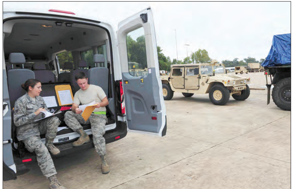
Airmen from the 821st Contingency Response Squadron conduct a joint inspection of hazardous cargo and equipment on Nov. 2 at Alexandria, La.