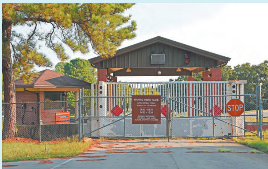
The Harris Road gate, commonly known as the “school gate,” will be open again beginning Aug. 14. The hours of operation will be 6:30 - 8:30 a.m. and 2:30 - 4:30 p.m. Monday through Friday.