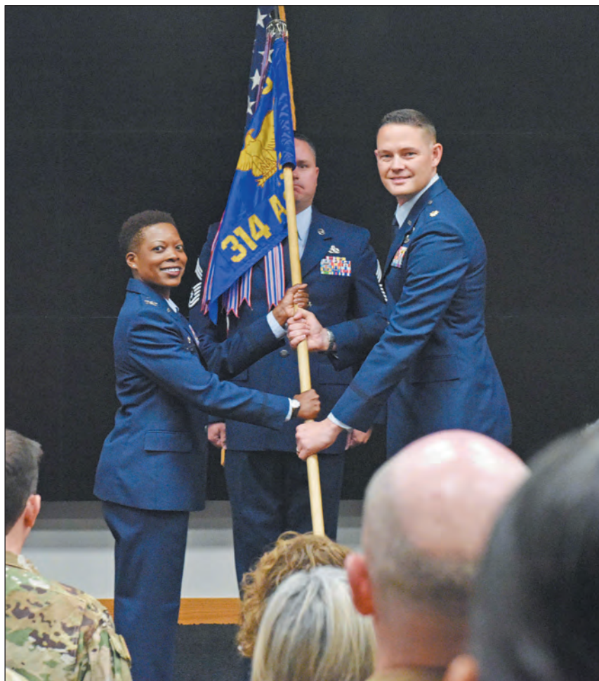
U.S. Air Force Maj. Michael Lasher assumes command of the 314th Aircraft Maintenance Squadron from Col. Argie Moore, 314th Maintenance Group commander, during a ceremony at Little Rock Air Force Base on July 30. The assumption of command marked the first step in transitioning the 314th AMXS back to active-duty maintainers.