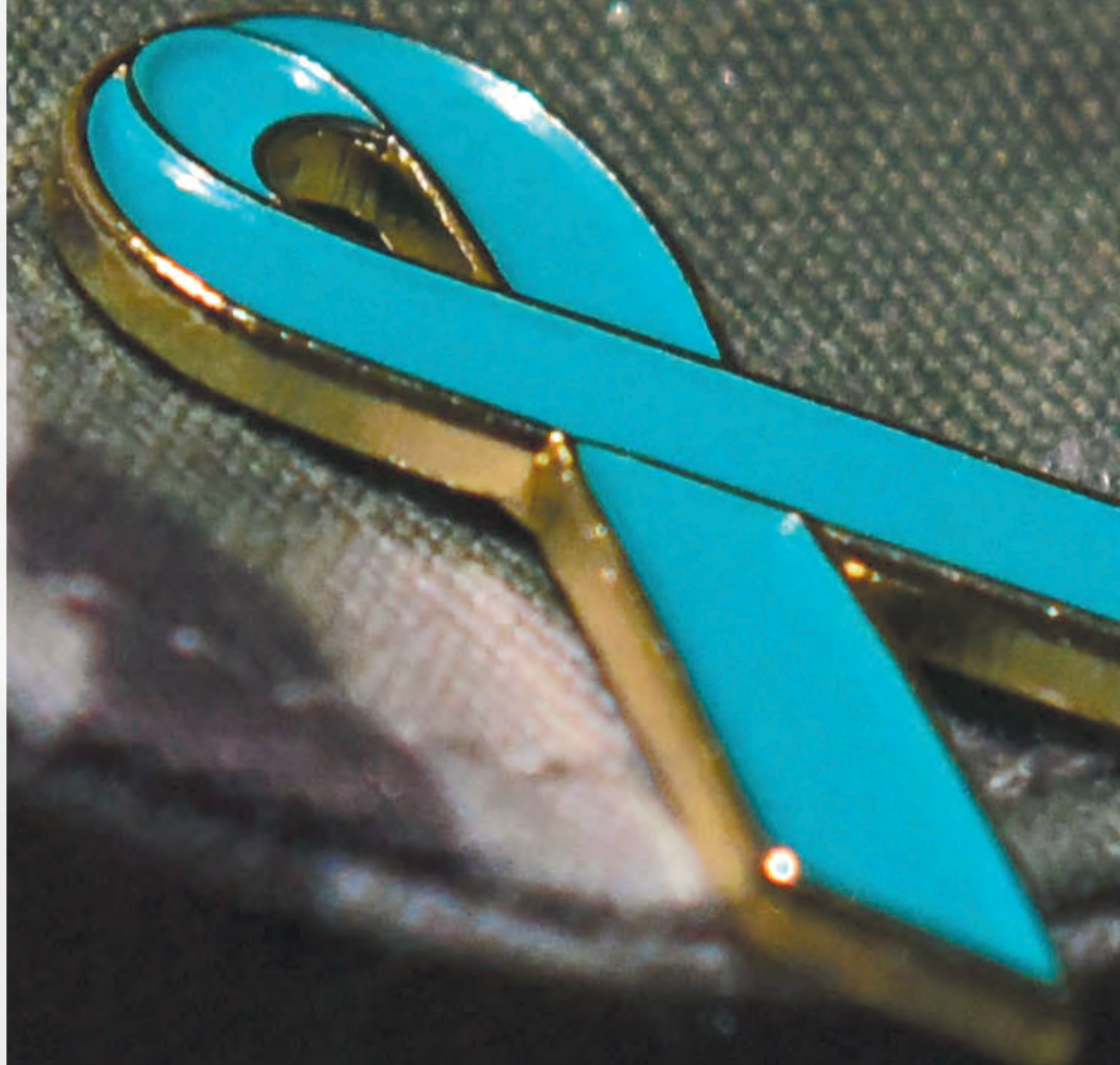
A soldier wears a Sexual Harassment/Assault Response and Prevention program pin at Joint Base Langley-Eustis, Va., on April 25, 2018.